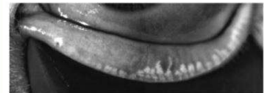
SIGNIFICANT GLAND LOSS