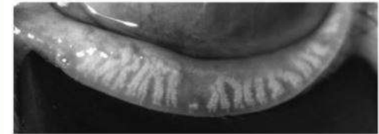
SHORTENED GLANDS & GLAND LOSS